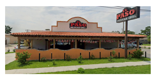
El Paso Mexican Grill (Chalmette, LA) Located on the Judge Perez Corridor.