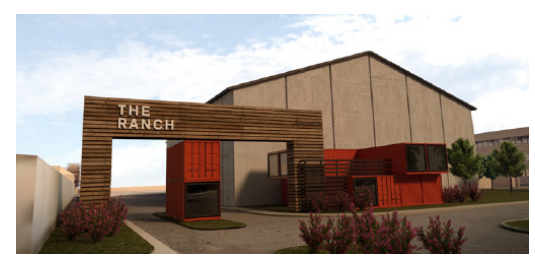
The Ranch Film Studio (Chalmette, LA) Located in the heart of the Central Business District.